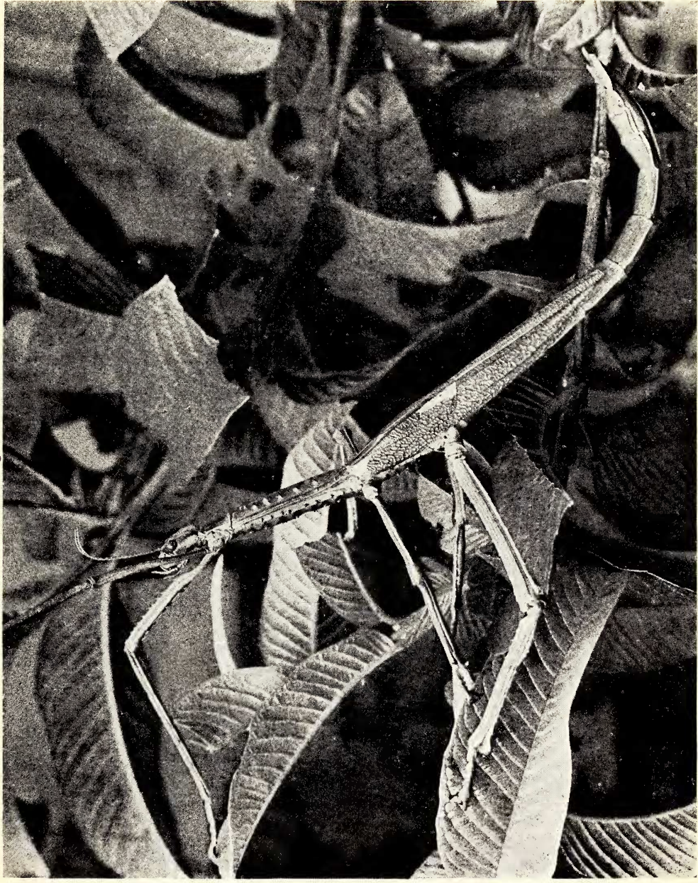
Adult Eurycnema goliath, the Giant Stick Insect